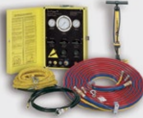
2. Low Pressure Air Test Kit