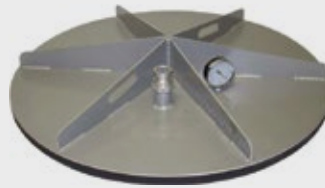
5. Vacuum Manhole Testing Plates