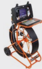
9. Inspection Camera