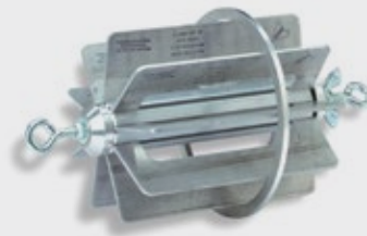
11. Deflection Gauges and Proving Rings