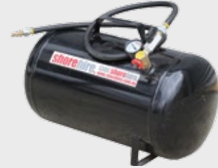
3. Portable Air Tank