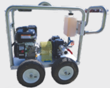
6. Vacuum Pump