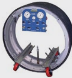
8. Pipe Joint Testing