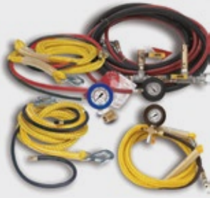
1. Hoses and Gauges