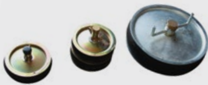
10. Mechanical Pipe Plugs (sale)