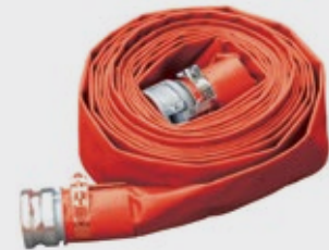
12. Layflat Hose Reel