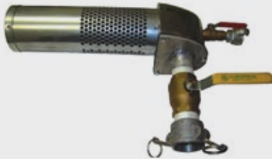
4. Venturi Vacuum