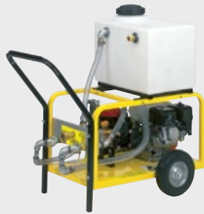
7. High Pressure Hydrostatic Testing