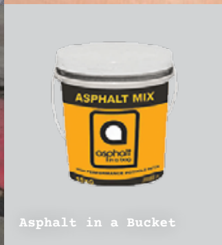
Asphalt in a Bucket