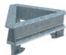
Flat Head Piece