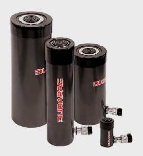
1. Hydraulic Jacks