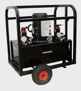
2. Electric Pumps