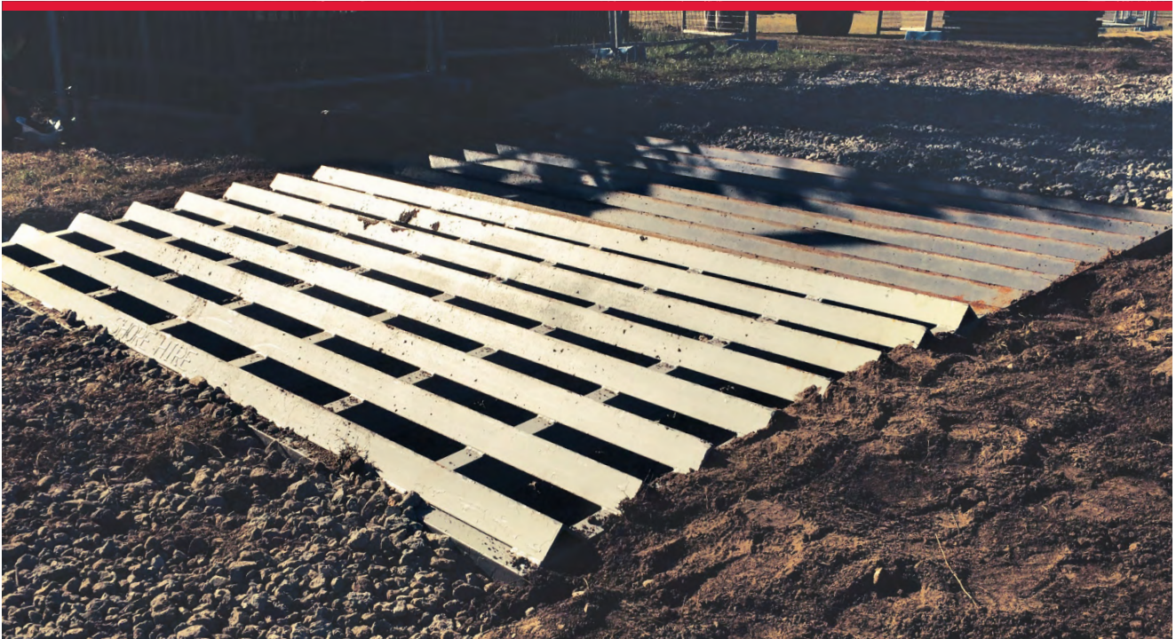
Rumble Grid Side Profile