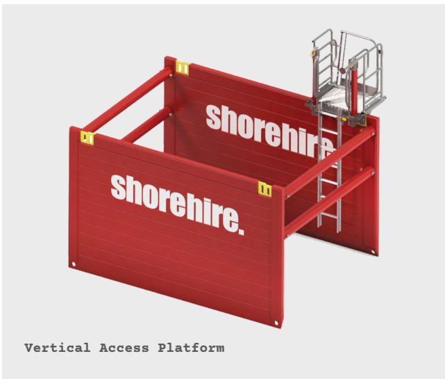
Vertical Access Platform