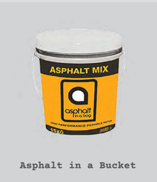
Asphalt in a Bucket