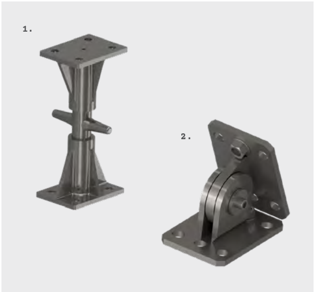
1. Assembly Jack Fully Closed