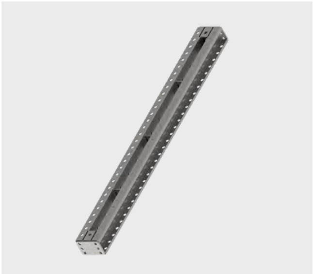
2. Assembly Rocking Head Round